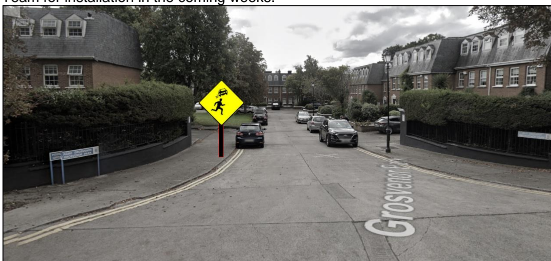
Proposed location of a Children Crossing (W 142) road sign at the entrance to Grosvenor Park.

The South East area engineer has conducted an assessment of Grosvenor Park, Leinster Road for Children Crossing (W 142) road sign. Following the assessment, the Traffic Advisory Group recommends installing a Children Crossing (W 142) road sign at the entrance to Grosvenor Park. A request will be forwarded to the Councils Signage Team for installation in the coming weeks.